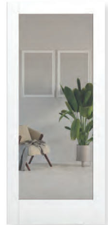
1 Lite Clear