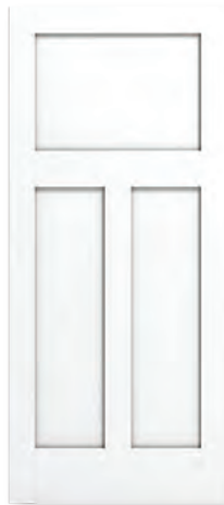
1 Over 2 Panel