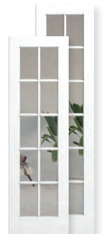
10 or 12 Lite Clear