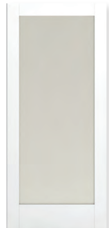
1 Lite Frit

SBP operates through six brands in the United States and Canada.